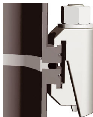
Figure 1: In case of ISO-KF and ISO-K up to DN 250 size, the centering ring is specified, so that the O-ring is compressed from about 5 mm to exactly 3.9 mm.

Although O-ring compounds are quite robust to handle, the seal or the seal surfaces can be damaged or scratched if opened frequently. Through baking out near the maximum temperature, O-rings are pressed over time into an oval shape, but can still remain sealed for a long period of time. Whether chemical, radiation or plasma attacks occur, for instance, depends upon the respective application.